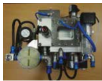
Customised Xaar Midas system for materials deposition application